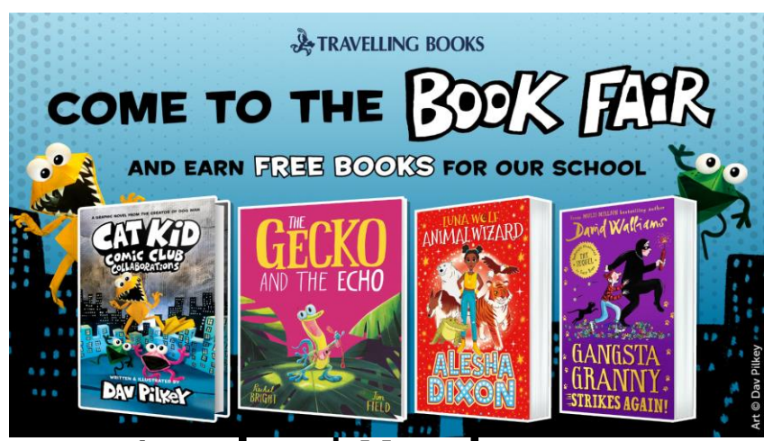
21<sup>st</sup> and 22<sup>nd</sup> March 3-3:30pm