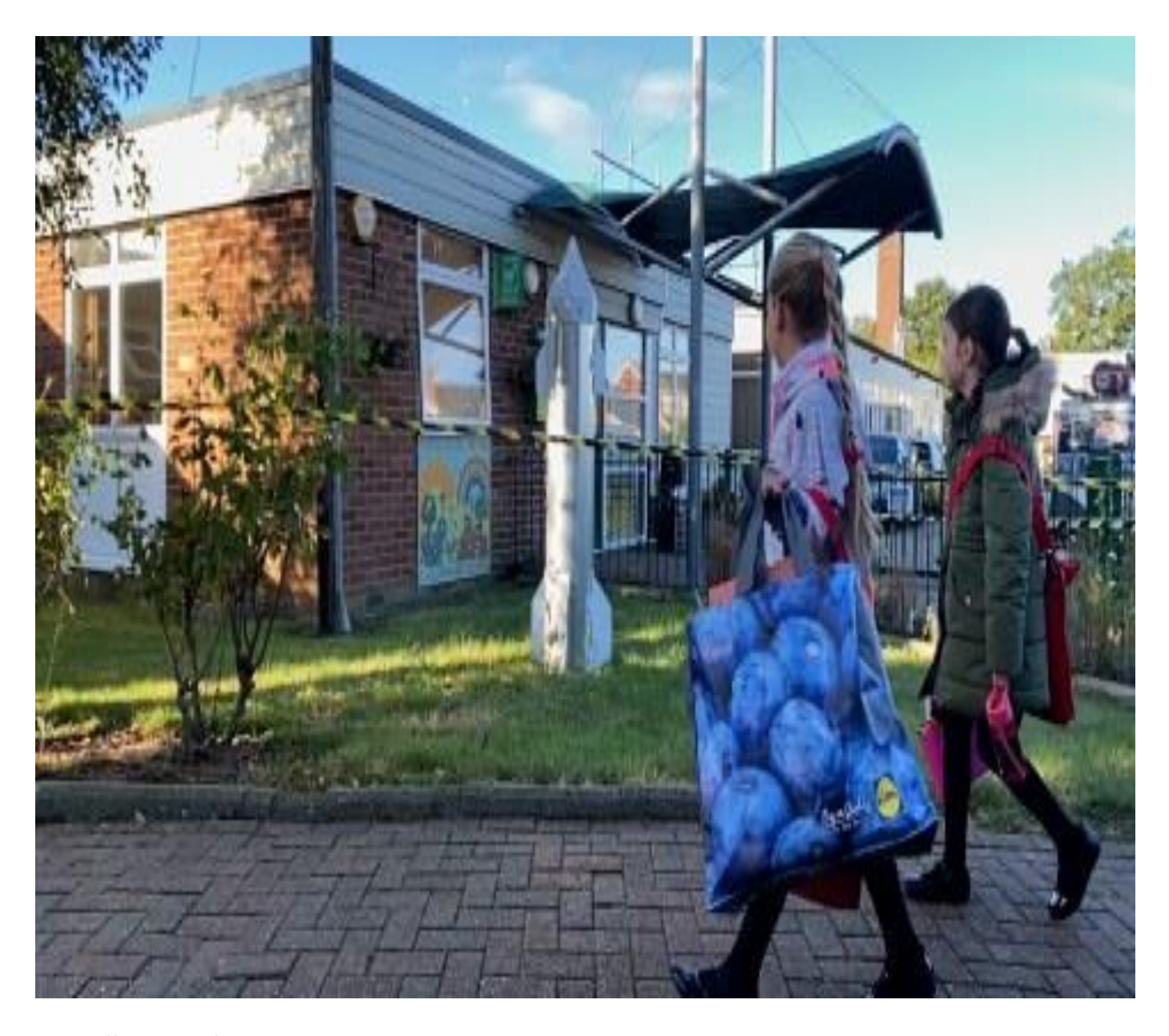
Travelling Book Fair